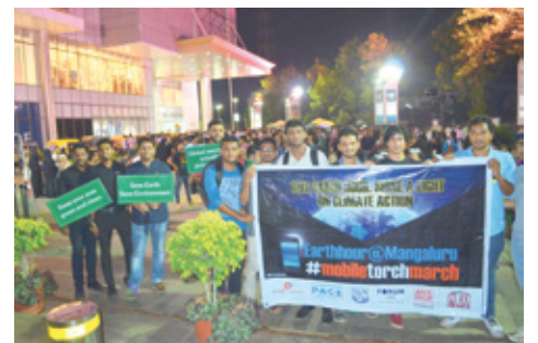
25-03-2017 & 26-03-2017 Celebrated Earth Hour by conducting a procession along with 1000 students of PA College of Engineering and various awareness activities at Forum Mall.