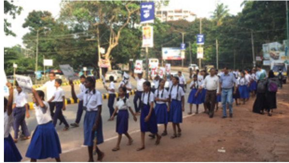
02-10-2016 Observing Gandhi Jayanti by conducting a road show along with the Mangaluru City Corporation.