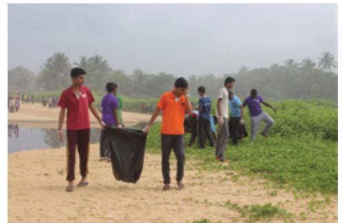
16-09-2017 Observed International Coastal Clean-up Day at Panambur Beach in association with the Indian Coast Guard and around 500 students from various schools and colleges.