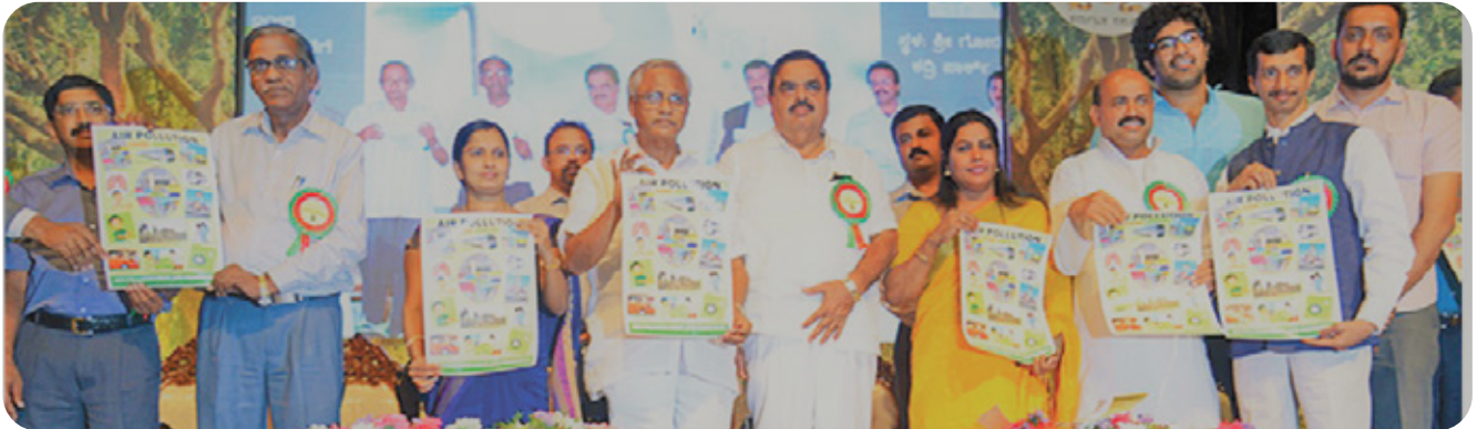
17-06-2017 celebrated World Environment Day in association with the Karnataka State Pollution Control Board. On this day we introduced information charts for schools & colleges.